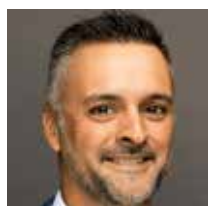
Frank Quintana City of Miami Beach