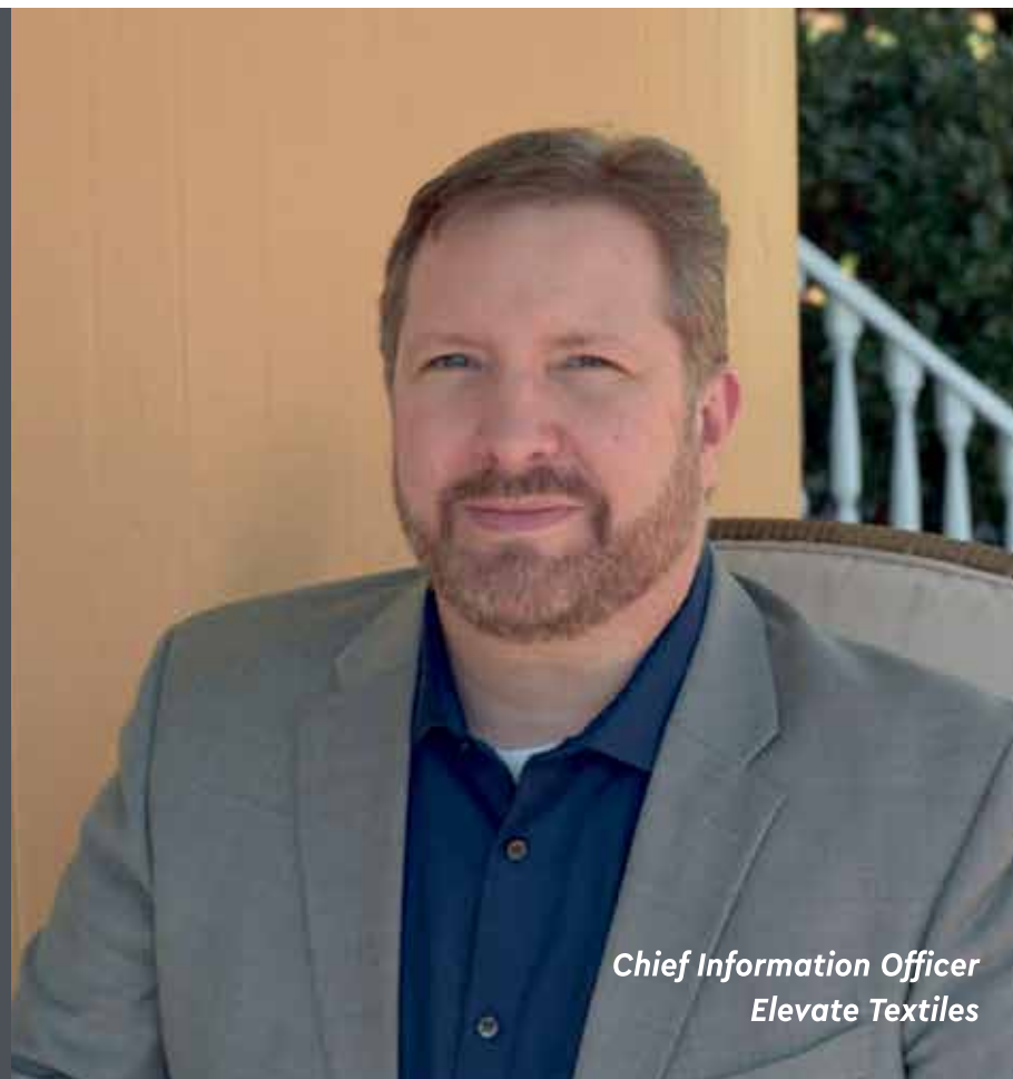
Chief Information Officer Elevate Textiles