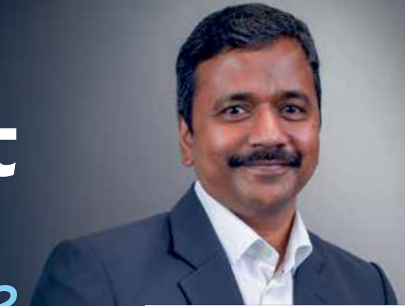
Chief Information Officer & Chief Digital Officer

Congratulations on being named as a finalist for the 2025 Carolina ORBIE Awards.