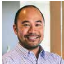
Uy Ut Francisco Partners